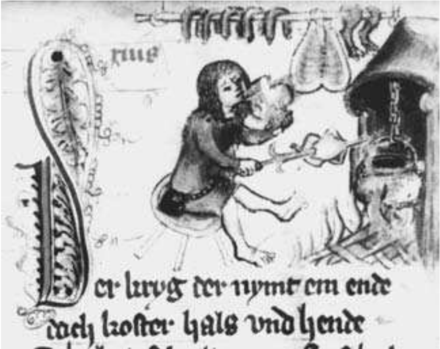
Food preparation. From Losbuch , ca. 1350. Cod. Vind. Series Nova 2652, fol. 4v.

stew. In fact, from the French word for cauldron, chaudière , comes the modern English word “chowder.” 3