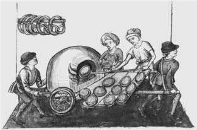
Pie bakers with movable oven. From Ulrich von Richental. Chronik des Konstanzer Konzils , ca. 1470. Cod. Vind. 3044, fol. 48v.

and their counterparts in France, the Viandier of Taillevent and the Menagier de Paris , for instance, has shown that rarely are they identical. To be sure, they are related to French cookery, but they also are evidence of the emergence of a new style of cookery that was distinctly English. 37 One example is the use of shellfish as an alternative to fish in English blanc manger recipes, something that would have been foreign to the French. A dish that is a close relative to blanc manger but is only found in England is called Blandissorye . Some of the different spellings of the name, such as the oldest Anglo-Norman Blanc desiree , suggest that it was believed to come from Syria. 38 In one of the two Anglo-Norman cookbooks it is followed by two other colored dishes “from Syria,” Vert desire , that is “green food from Syria,” and Jaune desire , or “yellow food from Syria.” 39 Given the Arab influence on European cooking in general, that, as we shall see, was even stronger in Britain than in northern France, Middle Eastern provenance of these dishes is quite likely. The following is a fast-day version of the Syrian white dish: