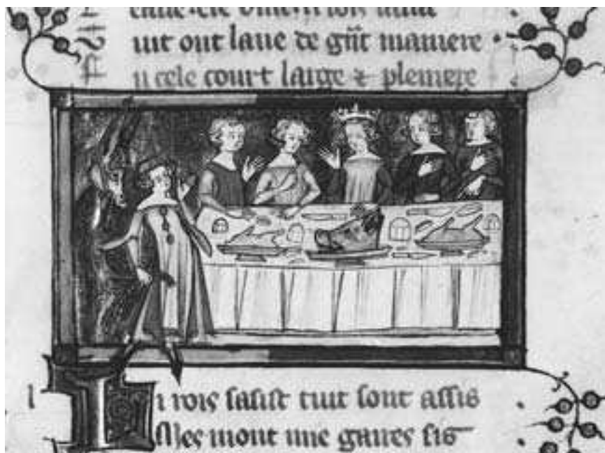
Boar's Head at Arthurian Feast, ca. 1340. From Cod. Vind. 2599, fol. 33r.

partridge, swan, pheasant, stork, heron, and many others. The section concludes with stuffed suckling pig. 81 With his next group of recipes Taillevent parallels the progression of an actual French feast, in which the roasts of the second course, le second mets , would have been followed by the entremets , dishes that could be sweet or savory and whose primary function was to entertain. Gilded foods, roasted birds returned to their plumage, boars' heads with flames shooting from their mouths, and pies filled with live birds are some of the more spectacular entremets in French cookbooks. An interesting showpiece combining two animals, a cock and a piglet, is called Cogz heaumez , or "Helmeted Cocks." To prepare them, piglets and poultry are roasted, the latter then stuffed, glazed with an egg batter, and seated on the piglets. As a finishing touch, the cocks or hens are equipped with paper helmets and lances. 82 While most of this preparation is still edible, the trend in the fifteenth century, as was shown earlier, was toward more and more complex constructions, often made of wood,