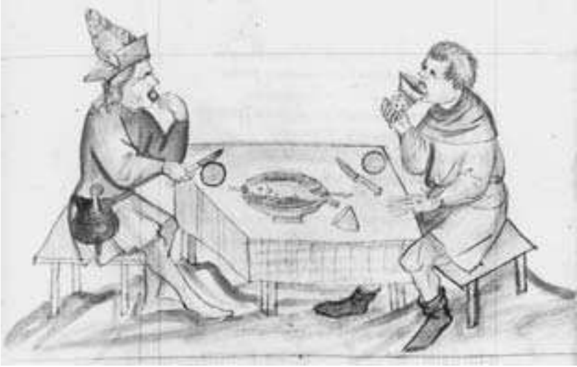
A simple meal. From Hugo von Trimberg. Renner , 1426. Cod. Vind. 30896, fol. 73r.

some of the places renowned for their fine linen. By providing napkins and hand towels it was hoped that diners would not wipe their hands on the tablecloth and soil it in the process. Given the hierarchical nature of a medieval meal, it should not surprise us to find that the best linen was used for the high table where the most important diners were seated. Well-worn linen, perhaps stained from previous meals, was given to the lowest-ranking diners.