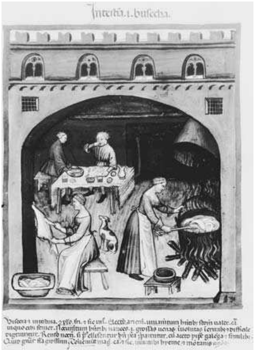
Preparing tripe. From Tacuinum sanitatis in medicina , 14th century. Cod. Vind. Series Nova 2644, fol. 81r.