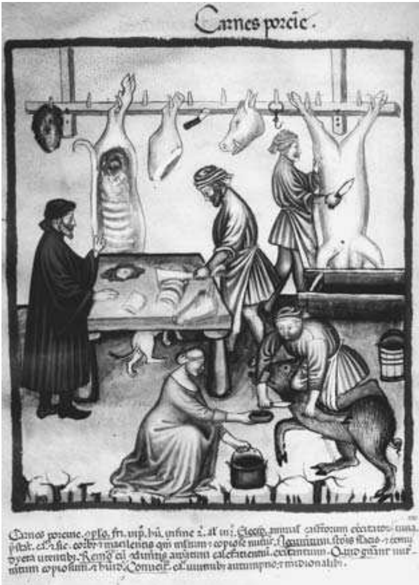
Butchering pigs. From Tacuinum sanitatis in medicina , 14th century. Cod. Vind. Series Nova 2644, fol. 74v.