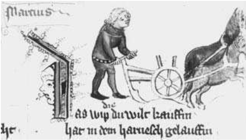
Plowing in March. From Losbuch , ca. 1350. Cod. Vind. Series Nova 2652, fol. 7v.

imal fodder. Unable to afford commercially made bread, or even ground flour, many would revert to grinding their own small batch of grains and turning it into unleavened flat bread, or simply into porridge. In upper-class cooking both flour and bread were used in a variety of ways. Pies, tarts, cakes, fritters, and mushes such as frumenty all contained wheat flour. Baked bread, especially barley or rye bread, was served as a disposable and edible plate known as a “trencher,” and bread crumbs were used as the thickener of choice for many preparations such as sauces and stuffings. Bread was also a popular coloring agent. Depending on the degree of toasting, it imparted to a dish a color ranging from light brown to black. Physicians regarded leavened bread made from the purest and finest wheat as the best and most nutritious. The coarser and denser rye bread and barley bread were seen as inferior and suitable for manual workers whose stomachs, unlike those of the rich, could handle such coarse foods full of bran. Warm bread fresh from the oven was considered nutritious but difficult to digest. Rye bread was said to digest quickly, produce “weak” blood, and overall provide little energy, while barley bread was criticized for being of a cold and flatulent nature.